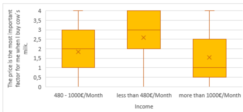
Figure 3. Different importance of milk price among Slovak seniors

It assumes that associations of seniors and Millennials are quite similar. Older adults seem to be more pragmatic; they associate the packaging of milk with typical packaging features and qualities (use-by date, cardboard box, traditions). Further research has shown that Slovak seniors prefer traditional motives and bright colours on the milk packaging. The importance of packaging in a selected group of the population was also investigated in the survey Ares et al. (2010). The team of authors concluded that the package (with the presence of the image) was the variable with the highest relative importance. The importance of this variable was high, suggesting that the package plays an essential role in the perception and purchase of food by consumers. Kruskal-Wallis one-way analysis of variance has shown (Figure 3) that there is a significant difference in the subjective importance of milk price among respondents with different monthly income ( p = 0,001 ). The higher is the monthly income of respondents, the less important is the price of milk.