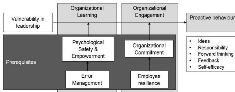
Figure 3. Model of influencing factors to proactivity

A successive assessment of 298 papers' abstracts and titles was excluded due to the research topic's missing reference. Consequently, 87 research articles were included in a full-text assessment, while in a final stage – 41 papers. To summarize the results highlighted in the last section, a new model was created that identifies the interlinkages and influencing factors mediating employees' proactive behavior.