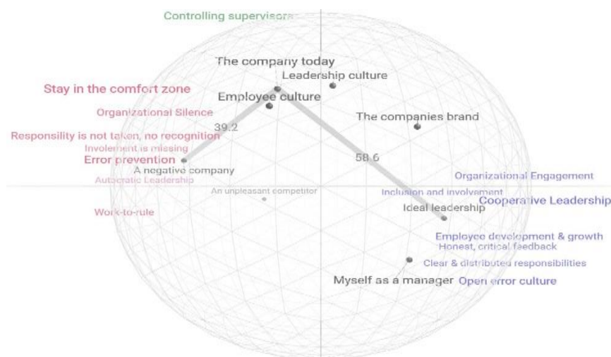
Figure 1. Visualization of the corporate culture case study

Results. Figure 1 shows some of the elements describing corporate culture in the three-dimensional space. The red and blue descriptions show the cluster of measurements consisting of 11 to 34 individual personal constructs.