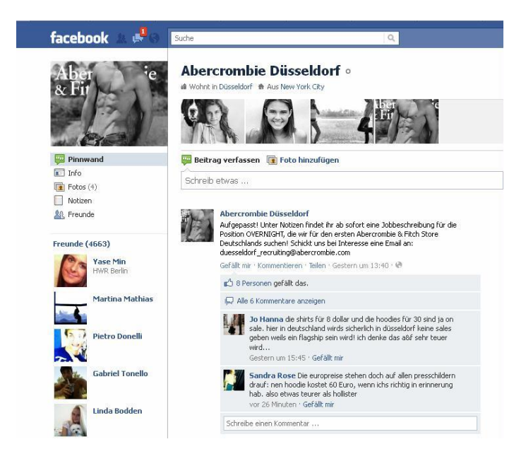
Figure 3 – The Facebook page of Abercrombie [13]

Good examples are companies which have built up a virtual group to inform the customer what is happening on their side. We would like to display one example which is currently happening on Facebook, it is the opening and first Abercrombie Fashion Store in Germany. Abercrombie, a well-known and very stylish fashion brand from USA, is going to open a flagship store in Duesseldorf. 9 month before the store is going to open Abercrombie introduced a Facebook Group with the title Abercrombie Duesseldorf. The aim of the group is building up relationship with the customer and to inform them about what is happening inside the company, inside the market and the progress of the development of the store. The group could gain up to know 4.663 friends and strong interaction between the customer and the company.