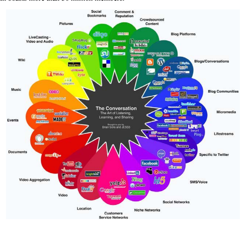
Figure 1 – The art of conversation – online channel proliferation [5]

When LinkedIn was introduced just in a year later in 2003, it had taken decidedly a more serious and sober approach to the social networking phenomenon. Rather than being a mere playground for former classmates, teenagers, and cyberspace, LinkedIn's aim was/is being a networking resource for businesspeople who want to connect with other professionals. Today, LinkedIn boasts more than 30 million members.