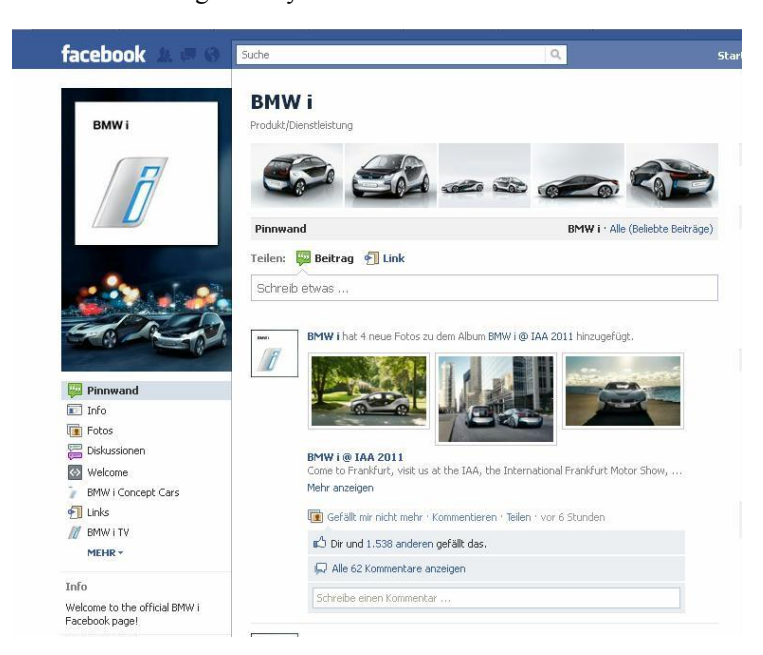
Figure 4 – The Facebook page of BMW [16]

This new development means for companies that they do not only present their new products online but more important are building-up a relationship with potential customer in a very early phase of the product development, e.g what BMW is doing right now with its new concept BMW i seams to be a good way forward.